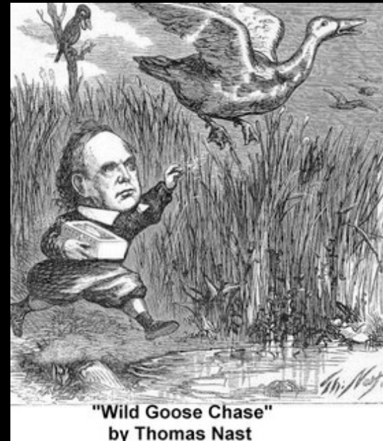
"Wild Goose Chase" by Thomas Nast